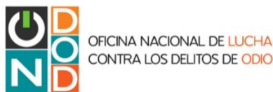
Image. – National ONDD Mark.

That is why it is necessary to keep in mind the “Spanish Law Enforcement Bodies’ Action Protocol for hate crimes and actions that infringe legal rules on discrimination”, as regards its list of unified, homogeneous rules and guidelines for police officers to identify, correctly gather and statistically record racist or xenophobic crimes and incidents or discriminatory behaviour, and to define the specific elements to be taken into account in police activity.