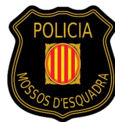
Image. – Emblems of the Navarre Chartered Police, Ertzaintza (Basque Police) and Mossos d'Esquadra (Catalan Police).