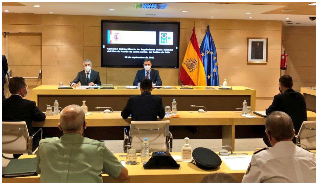
Image. - Extraordinary Monitoring Committee for the First Action Plan

Likewise, it is worth mentioning that in September 2021 the first Action Plan was concluded by the Extraordinary Monitoring Committee presided over by the Prime Minister of the Government, announcing eight lines of action for this 2 nd Action Plan.