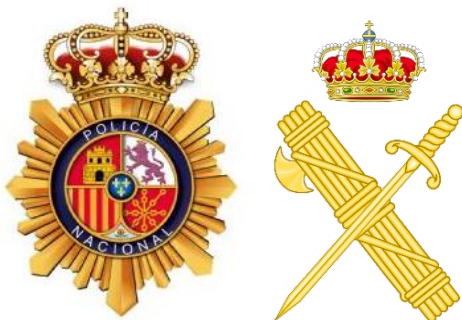
Image. – Emblems of the National Police and Civil Guard.

This Second Action Plan is again articulated through the Secretariat of State for Security, with the National Office to Combat Hate Crimes (ONDOD) , answering to the Directorate General for Coordination and Studies, which is the body entrusted with fostering, coordinating and supervising it.