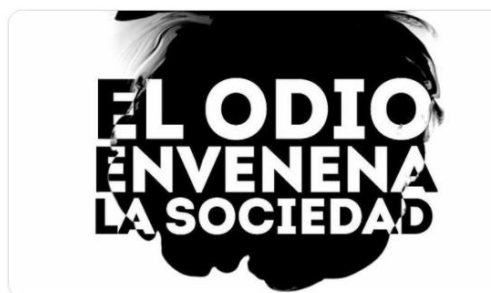
Image. – Slogan for the campaign to raise awareness about hate crimes by the Ministry of the Interior.

15.3. Creating accounts for the National Office to Combat Hate Crimes in the social networks deemed relevant, thereby enabling greater dissemination and visibility for the information published via the Ministry of the Interior's website and the ONDOD itself, which shall be controlled and managed through the national office. Implementation: First half of 2022.