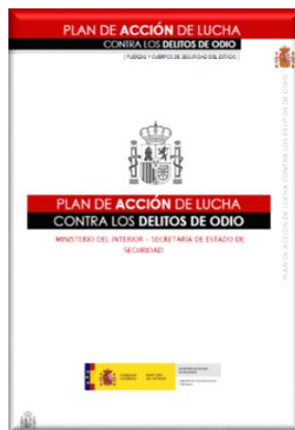
Image. - First “Action Plan to combat hate crimes” (2019-2021). Source: – 1st Action Plan .

Hence, the previous Action Plan is now in the process of implementation, with six measures that were considered but which are yet to be completed, numbered: 9.4, 10.3, 12.1, 12.2, 12.3 and 13.4, several of which are inter-related 1 . These measures have been included in this 2 nd Action Plan to combat crime (2022-2024) , together with other completely new ones, where the main aim is “assistance and support for victims of hate crime” and the intention is to carry on the important work that has been done by the law enforcement bodies together with the social economy institutions, organisations and associations involved, as well as the National Office to Combat Hate Crimes.